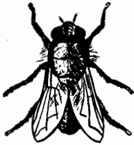
Flies on Cattle cost $440,000

Six common pests cost Missouri at least $1,740,000 a year