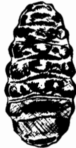
Cattle grubs cost $60,000