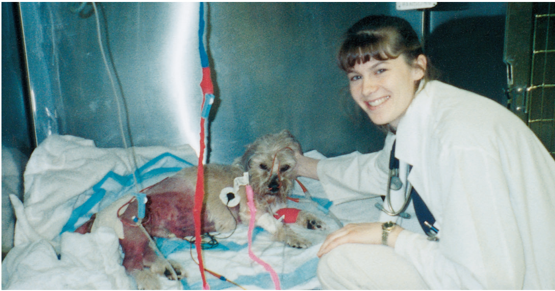
Most of the skin on Ruffy's back was scraped away when he was briefly dragged under the pickup truck. It was initially thought that no hair would ever grow on the resulting scar tissue. The hair did grow back, but it was of a different color.

little dog, cringing in his cage. He joined the Clarke family that very day.