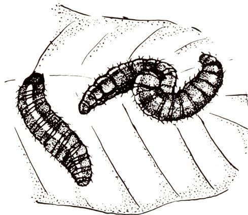
Alfalfa Weevil Larvae

feeding while higher temperatures force the weevils into summer estivation. Most of these adult weevils leave the alfalfa fields by flight in June. These adults enter surrounding vegetation where they remain inactive during the summer, but they move back into alfalfa in late summer and fall to resume feeding and begin egg laying.