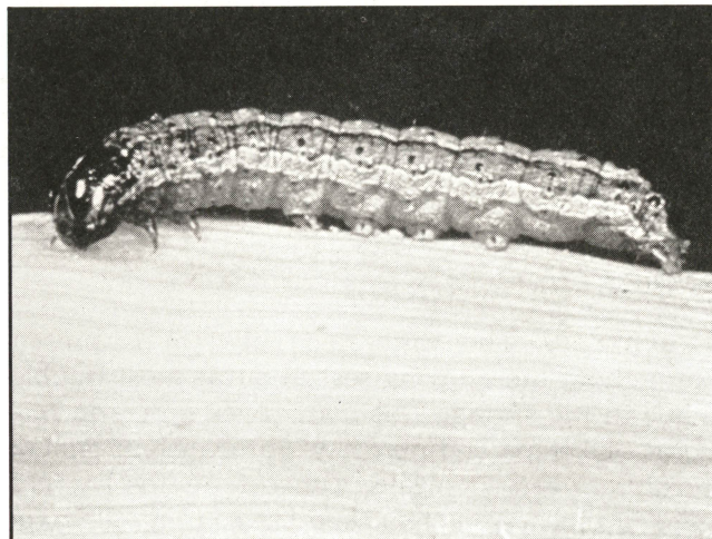
Figure 2. Fall armyworm larvae.

The larvae are about 1 1/4 inches long when full grown. They are smooth-skinned and vary consid-