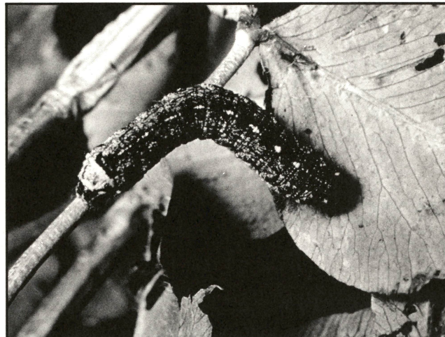
Figure 1. Variegated cutworm larvae with conspicuous row of white spots down the middle of the back.

Identification and damage. These larvae are about 2 inches long when fully grown and range in color from black to light greenish-yellow or tan. They have a distinctive row of light yellow diamond-shaped spots down the middle of their backs (Figure 1).