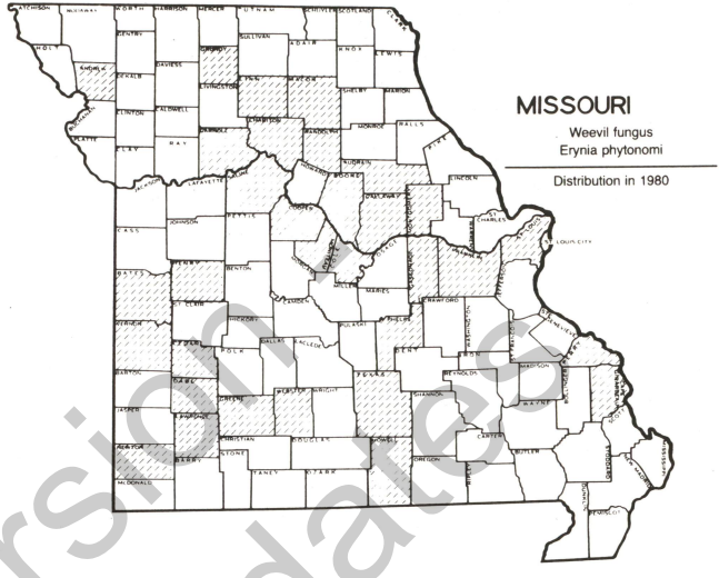
Fungus disease may help control alfalfa weevil larvae. See the section on weevil disease on page 3.

The alfalfa weevil overwinters as an adult in alfalfa fields and as eggs within dead alfalfa stems. The overwintering eggs begin hatching in late February and March or about the time alfalfa begins growing in the southern counties. Adult weevils return to alfalfa fields in the fall to overwinter. These adults start laying eggs upon their return and may continue egg deposition throughout the winter during extended warm periods. In spring, egg laying is resumed or continued.