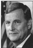
Mel Carnahan, JD '59 Governor of Missouri Jefferson City A loyal supporter of the Law School who is dedicated to improving support for education throughout Missouri