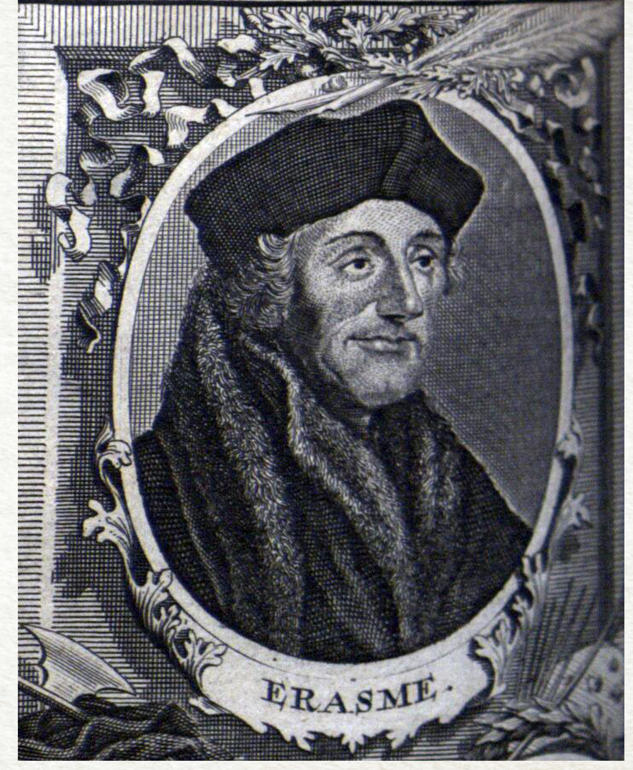
Portrait of Desiderius Erasmus, from L'eloge de la folie (Leiden, 1715).

In 1936, Dale Carnegie published his How to Win Friends and Influence People , launching the self-help movement, fueled by the sense that we are just twelve steps away from an improved version of ourselves. Our "you go girl" culture is thoroughly Pelagian.