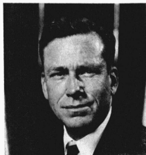
Gov. Warren E. Hearnes