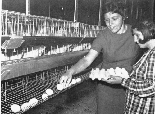
An egg farm of the type operated at Palatine, Ill., will be constructed at the Woodhaven Home.