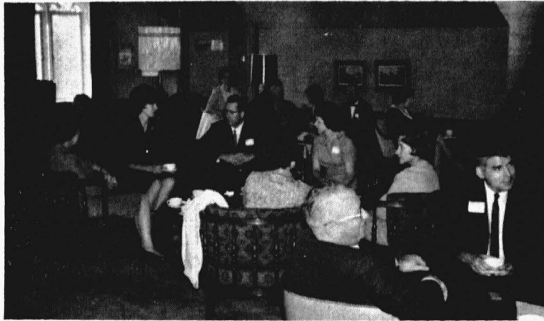
Alumni leaders during a coffee break in the Faculty-Alumni Lounge of the Student Union.