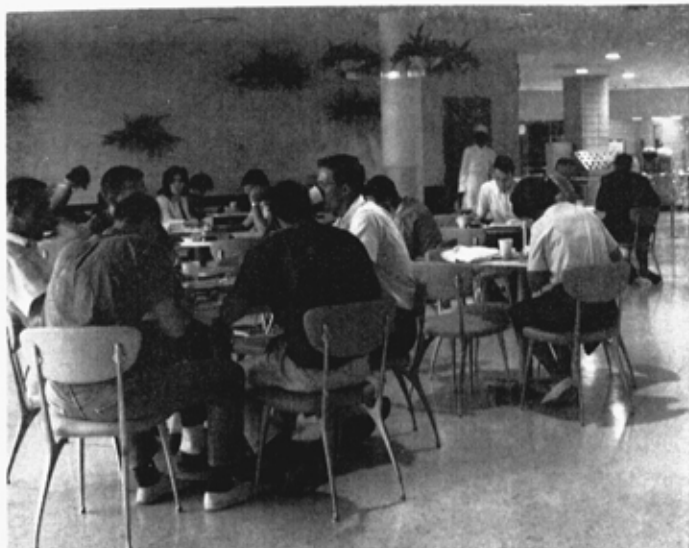
The attractive decor also extends to the snack bar on the main floor. The University Book Store has permanent quarters across the corridor.