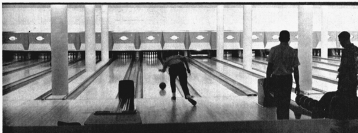
Sixteen bowling lanes are located in the basement. Billiards are also available in the games area. Both are innovations in student recreational facilities at the University.