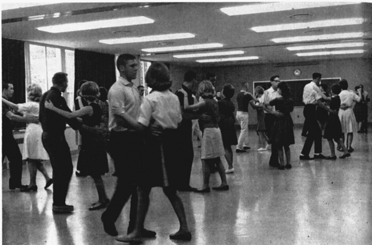
This room, one of the most spacious in the Student Commons, is adaptable to a variety of functions, such as lectures, conferences and demonstrations. On this occasion freshman and sophomore students were receiving social dance instruction in a physical education course.