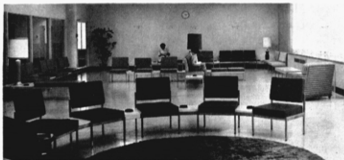
A favorite spot is the inviting browsing lounge with its tasteful furnishings and sweeping view of the south campus.