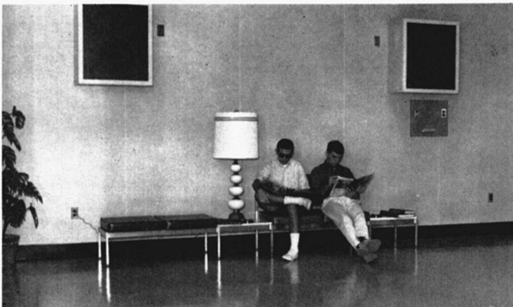
A small area of the listening room where students may relax to the accompaniment of music they may select from a library of classical recordings.