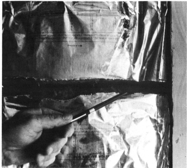
Figure 2. Poor workmanship during installation is a major problem with insulation in today's home. The poor fit shown here leaves an uninsulated area of the wall which the homeowner will probably never see, but which will add cost to every fuel bill.

Moisture does not need to be a problem in your home if you recognize it as a part of the home environment and manage it accordingly. Additional information on moisture problems and their control can be found in UMC Guides 1704, 1708 and 1709, available through your county University of Missouri Extension Center.