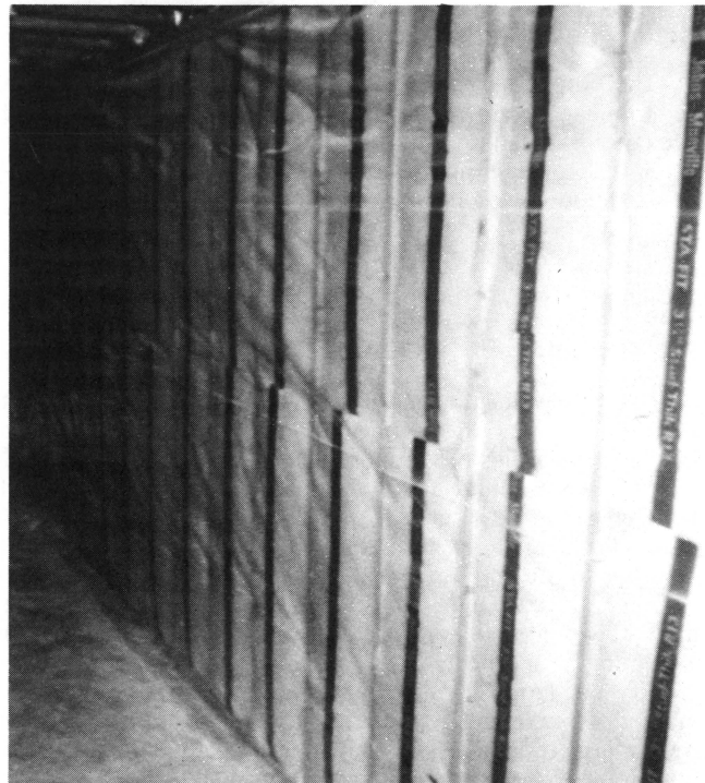
Figure 3. This well insulated exterior wall section contains 3½-inch-thick fiber glass batts. A clear polyethylene sheet has been placed over the batts to act as a vapor barrier. Clear polyethylene provides an excellent vapor barrier and has good transparency so carpenters or dry wall installers can see stud faces easily when they apply the interior wall covering.