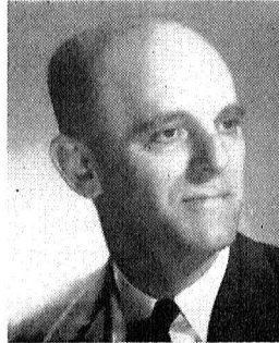
O. Hobart Mowrer