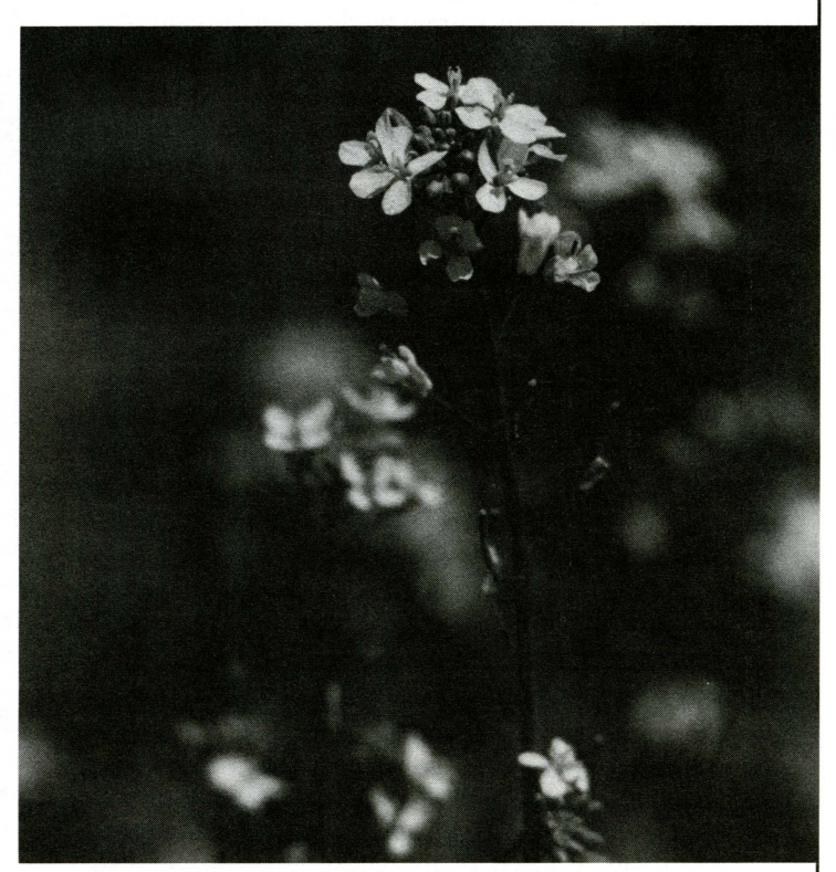
Single stalk of canola showing flower and pod development.

Before harvest, the combine should be checked thoroughly for any small holes in the grain table, grain tank, and augers. Holes can be fixed with either duct tape or a caulking compound. Combine cylinder speed, grain table reel speed and ground speed should be reduced to minimize shattering losses and to handle the large volution of material. The concave should be set to allow the to be threshed without breaking up too much of the stem. Excessive threshing of the stems will cause the sieves to be overloaded and result in improperly cleaned grain.