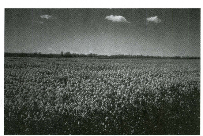
A field of canola in full bloom in early April.

Canola (Brassica napus L.) varieties have been developed as both summer and winter annuals. The winter type is best adapted for Missouri conditions