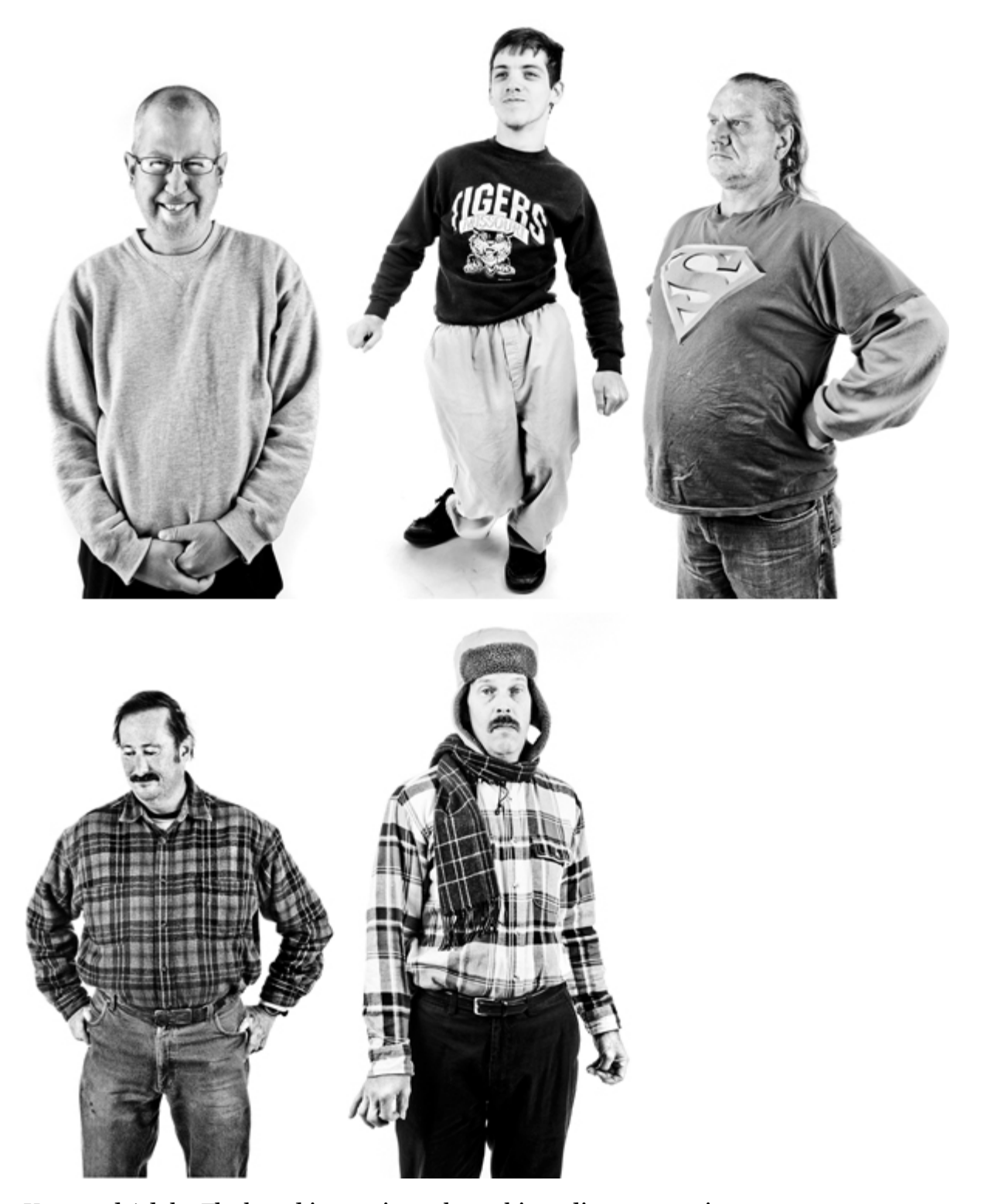
You need Adobe Flash and javascript to hear this audio presentation.

Keep up with all things Mizzou by <u>fjoining MIZZOU magazine on Facebook.</u>