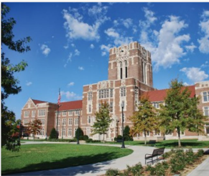
Ayres Hall is a four-story, brick and limestone building, long recognized as a UT campus icon.

Founded: 1794, one of the oldest public universities in the country; land-grant, flagship institution