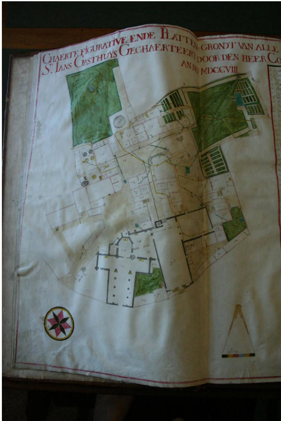
Map 3: The Early Modern Hospital of Saint John 3