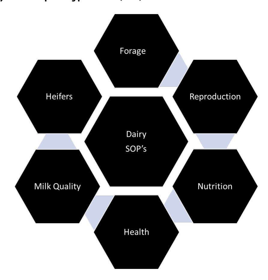
Exhibit A2. Dairy standard operating procedures (SOPs).