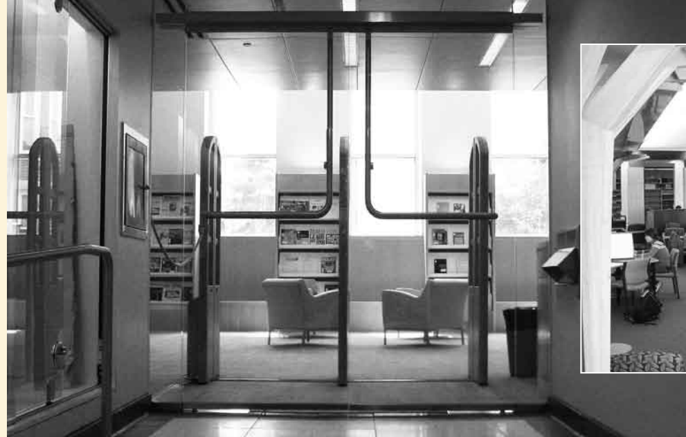
A brand new Journalism Library facility opened in the new Donald W. Reynolds Journalism Institute in the summer of 2008.