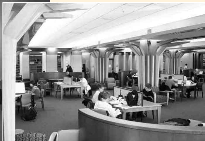
The James B. Nutter Family Information Commons is located in the south end of Ellis Library.

ELTC features 50 computer workstations and five wireless laptops for checkout.