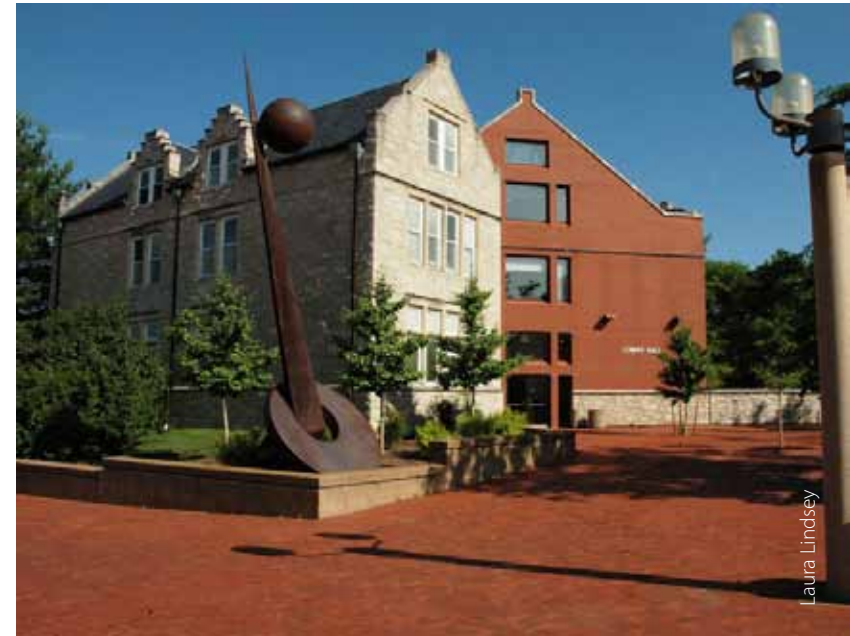
Lowry Hall, from the southwest, as it appears today.

During this same time, after decades of talks and plans, Lowry Street was closed to automobiles and became a strictly pedestrian street. Today it is called Lowry Mall. To emphasize the centrality of that part of campus as a transitional area between the quadrangle–red campus and the Memorial