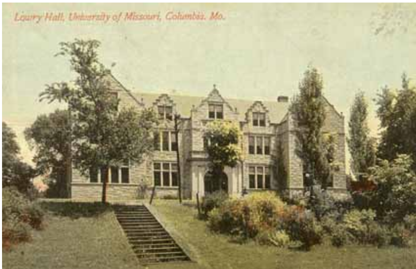
Postcard of Lowry Hall from the west.

The Bible College had no official or financial ties to the University of Missouri. However, university presidents and other university staff had served on the Bible College's board of trustees to facilitate cooperation between the two institutions. The Bible College's function was to supplement the instructional work of the university. It would not duplicate any classes offered by the university, but rather, was