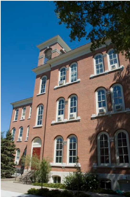
Side view of Switzler Hall, 2005.