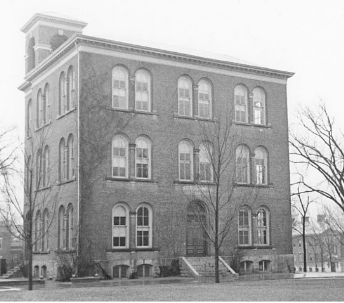
Switzler Hall, 1871.

During its history, the building has housed the College of Agriculture, the School of Journalism, and civil engineering offices. Today, the building houses the Department of Communication and the Special Degrees Program.