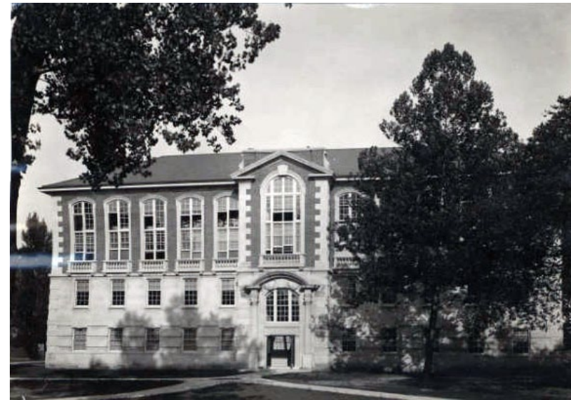
Side view of Tate Hall, 1927.