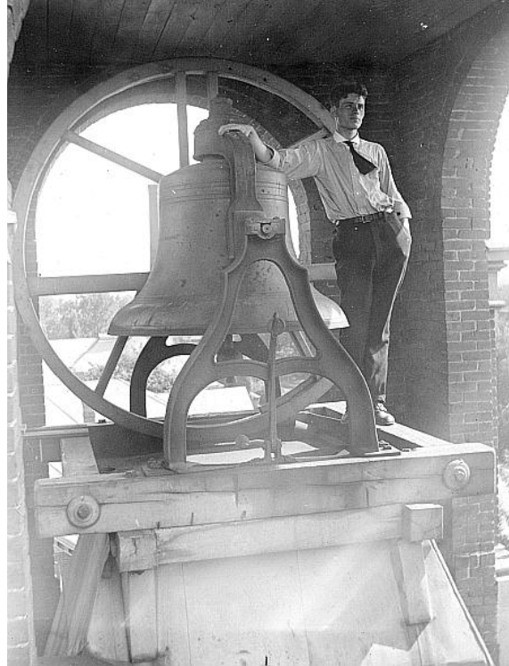
A student with the Switzler Hall bell in 1909.

vided him. He joined the Navy in WWI. When he returned home, he worked in the family's theatrical business only a few days before he was killed. The Tates agreed to donate $75,000 for the construction of the building on the assumption that the state would pay the remaining amount. The building was almost not built because the state would not release its portion of the money because of a state revenue shortage. Two years later, the money was released and construction began. The building was fire-proofed in order to protect the law library, and an