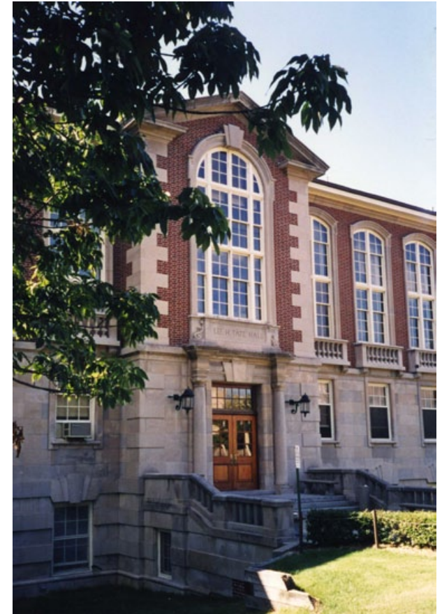
Tate Hall today