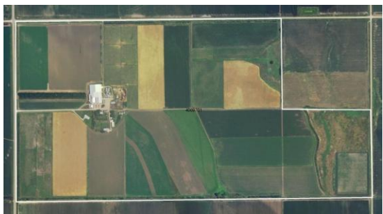
Figure 3. Farm 2