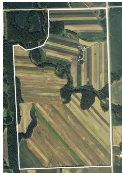
Figure 3. Farm 4

Farm 1 has an extensive windbreak system around and within the farm system. Thirty-eight acres are committed to woody land cover. The value of windbreaks is reflected in the production