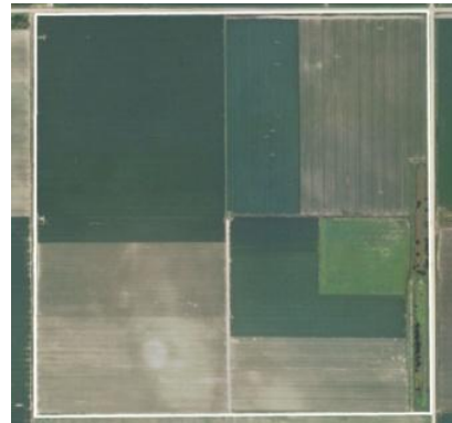
Figure 4. Farm 3