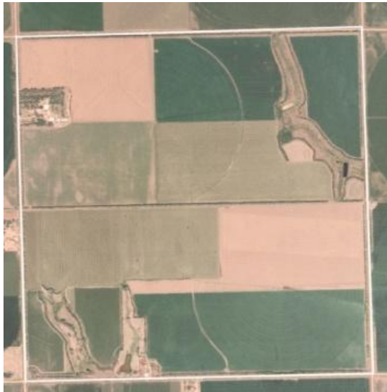
Figure 2. Farm 1

U.S. Farm Service Agency color digital imagery was used to assess land use and land cover patterns on participating farms. It is interesting to note that all participating farms include either planned or associated woody land cover features with windbreaks being the most frequent planned land-cover. Perimeter windbreaks were found on half of the farms while interior windbreaks were found only on \frac{1}{4} suggesting that there is potential to improve the use of windbreaks in organic farm systems. Riparian forest buffers were part of nineteen farm systems. Four farms are presented here to demonstrate how the Healthy Farm Index incorporates the benefits provided by woody land cover.