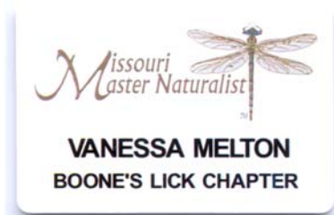
Figure 1: Official Master Naturalist Name Badge and Initial Certification Pin

Every year that volunteers successfully recertify, they receive a specially designed pin. These limited edition pins are designed by a MDC artist. They depict Missouri flora and fauna. Volunteers who are active but unable to recertify in a given year are still considered Master Naturalists, but they won't be considered certified or receive the limited edition pin for that year. Once a Master Naturalist has completed their initial certification they have the opportunity to recertify every year.