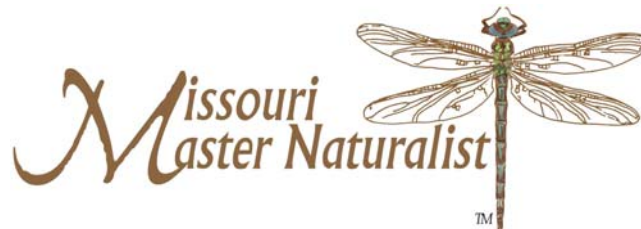
Figure 4. Missouri Master Naturalist Official Program Logo.

The official logo consists of the Program name, and a drawing of a Cyrano darner dragonfly ( Nasiaeschna pentacantha ). All letters in the Program name are written in Albertus MT Standard italicized font, except for the capital M, which is written in Ex Pronto Pro regular font. Contact the State Coordinators for electronic files of the logo.