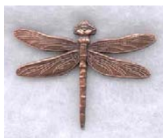
Figure 6: Honorary Master Naturalist Pin, Copper Dragonfly

A Chapter may also choose to establish local awards. An example of such an award might include "the most hours served" or "outstanding member of the year." These awards are completely up to the Chapter to create and award, but they are a fun way to recognize exemplary volunteers.