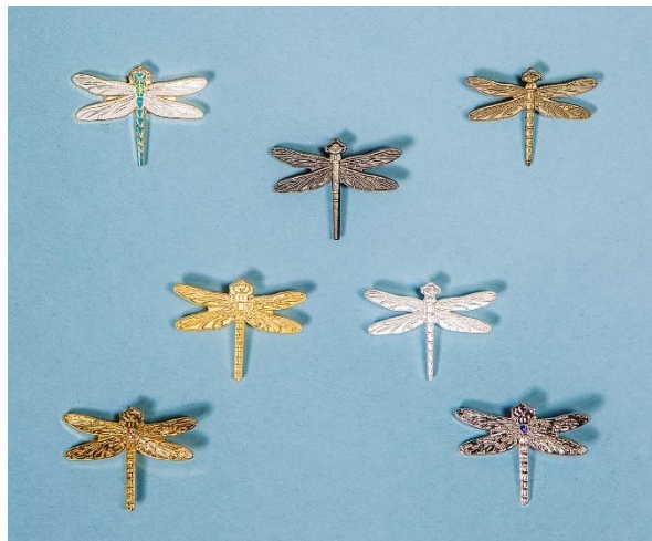
Figure 3. Milestone pins. Left to right, top to bottom: Initial Certification; 250 hours (bronze); 500 hours (pewter); 1,000 hours (gold); 2,500 hours (silver); 5,000 hours (polished gold with diamond rhinestone); 7,500 hours (polished silver with blue rhinestone)

The Master Naturalist program offers a series of pins commemorating different milestone achievements. Milestone pins honor volunteers who have given 250, 500, 1,000, 2,500, and 5,000, and 7,500 hours of service and are maintaining annual certification. These hours are cumulative. Volunteers may reach a milestone within one year or over the course of several years.