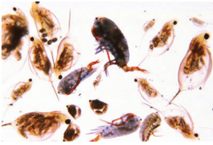
Figure 5. Zooplankton are an important food source for prawns, especially during the first few weeks after stocking.