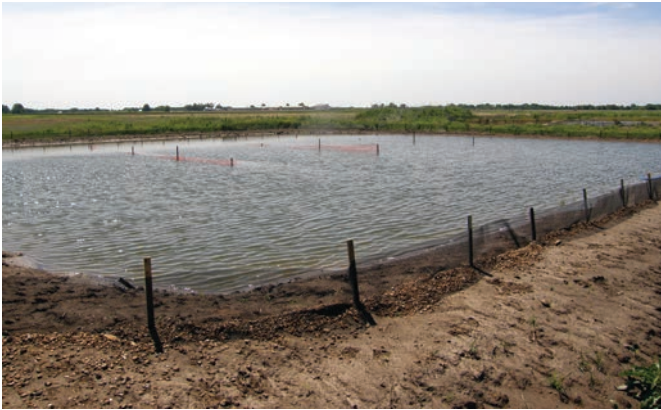
Figure 3. A properly constructed pond can be filled and fertilized so that a phytoplankton bloom is established for zooplankton production well in advance of stocking the juveniles.

The inside slopes of levees generally range from 2-to-1 to 3-to-1. This may vary somewhat due to pond size and soil type. Levee tops that are at least 20 feet wide should be adequate for equipment and management access. Erosion from wind and waves is generally not a problem, as most prawn ponds are smaller than 3 acres; however, 1 foot of freeboard above the water level is recommended.