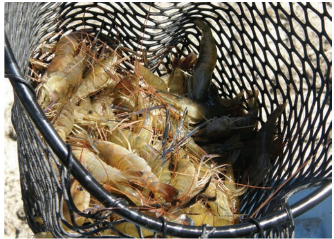
Figure 7. Prawns can be harvested by seining or netting in ponds that cannot be drained.

* As-fed weight of diet/wet biomass of prawns x 100.