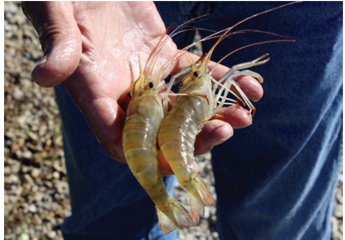
Figure 1. Freshwater prawn production is a viable venture in Missouri thanks to new cultural techniques and management practices.