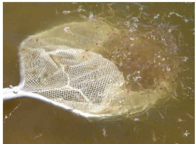
Figure 6. Juvenile prawns can be stocked in fertilized ponds when water temperatures are warm enough in spring.

Stocking rates that will provide a marketable prawn after a four- to five-month growing season generally range from 8,000 to 12,000 per acre. Lower stocking densities may yield larger prawns but lower total harvested poundage. Mean individual weight at harvest is inversely proportional