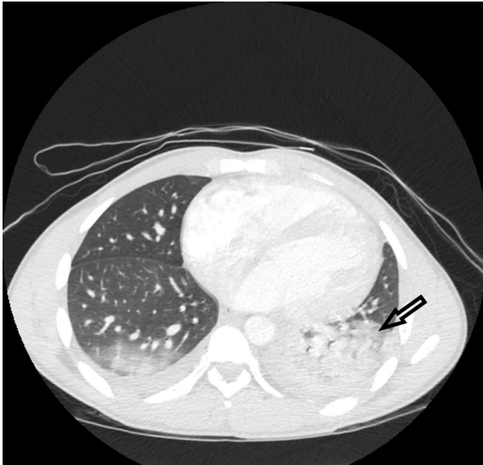
Figure 3. Left lower lobe dense consolidation and small right lower lobe pleural effusion with atelectasis.