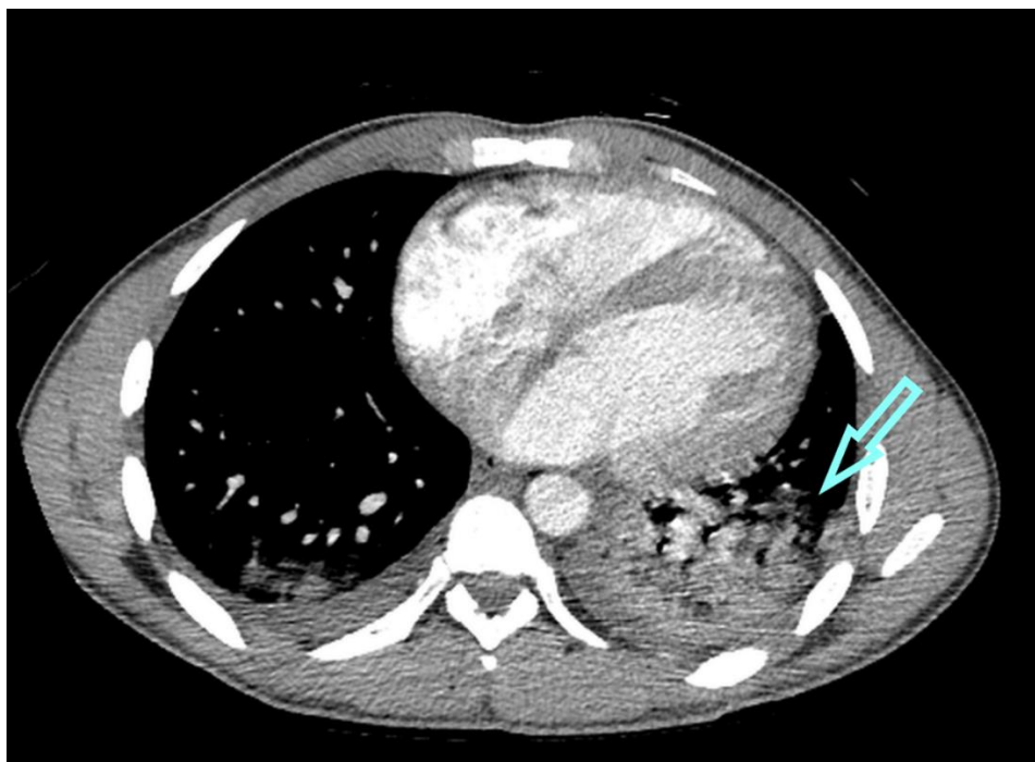
Figure 2. Mediastinal window of the same left lower lobe dense consolidation and small right lower lobe pleural effusion and atelectasis.