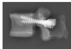
Radiograph displaying placement of two pedicle screws