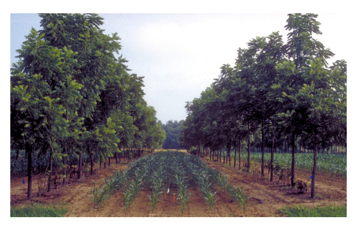
Black walnut and corn alley cropping

For ideas on marketing and guidelines for budgeting a black walnut orchard, contact the UMCA at blackwalnut@missouri.edu. The UMCA offers additional information on marketing specialty crops and has designed an Agroforestry Black Walnut Financial Model to assist with decisions including tree spacing, nut harvest and whether to use improved trees. (grafted) unimproved or This convenient spreadsheet tool will help make estimates about future nut production and tree diameters. Visit centerforagroforestry.org to access more information.