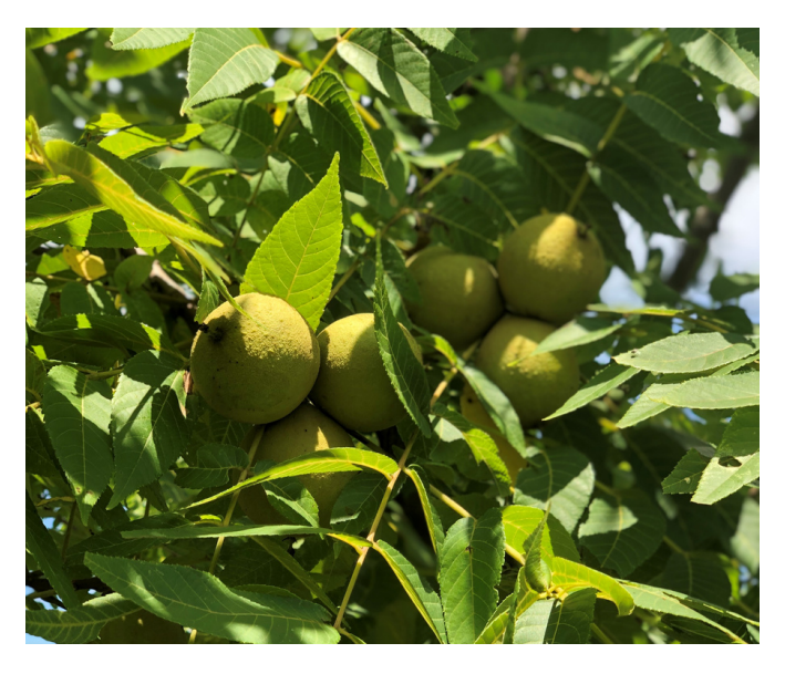
Nut clusters on a mature black walnut tree

trees can be maintained using herbicides and/or the application of wood chip mulch. Do not use hay or grass clippings to mulch your trees, as these types of "soft" mulches can provide an excellent shelter for tree-gnawing rodents. Planting a cool season perennial, lowgrowing grass that can tolerate frequent mowing is recommended to conserve moisture between tree rows.