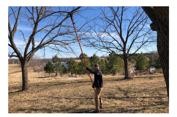
An extendable pole saw, or pole pruner may be used to remove low-hanging, water sprouts, broken, weak, or diseased branches during dormant winter pruning in a mature black walnut orchard.

Pruning Mature Trees Pruning should be done during winter while the trees are dormant. Dormant winter pruning will promote new growth, while summer pruning will inhibit growth. Careful pruning during the establishment of the orchard will lead to the development of desirable canopy structure of the trees, while pruning at bearing age will help maintain that structure and promote nut production (see right image). Pruning bearing trees can also help to facilitate mechanical harvest. Prune mature trees to remove low hanging, broken, weak, or diseased branches, as well as eliminate any water sprouts. Remove branches that are crossing or rubbing together. Every time you prune walnut trees (dormant or summer pruning), look to correct tree structural problems. If a branch has formed a narrow crotch at the point of connection with the trunk, remove the entire branch to eliminate future problems with limb breakage. The goal is to promote two or three well-spaced lateral branches that are oriented evenly around the trunk and staggered with respect to those below them to create a wellbalanced crown. Avoid cutting branches that are greater in size than one-third of the main trunk. It is not recommended to paint cut wounds.