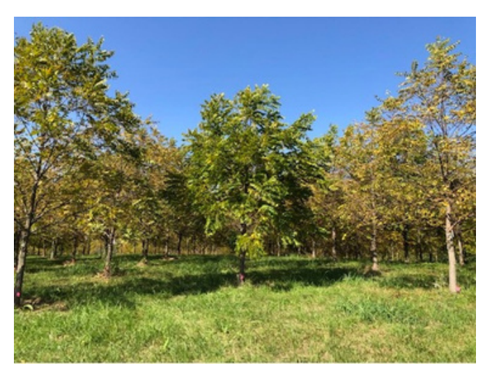
Green, anthracnose resistant tree (center) surrounded by yellowing, partially defoliated anthracnose susceptible trees in late summer.

see bottom right image). Timing of this application is critical, so cultivar differences in flowering date must be considered. The earliest flowering trees may require a second fungicide application 10 to 14 days after the first spray. During an unusually wet spring, additional fungicide applications may also be necessary.