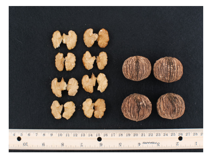
Black walnut nut meat and shells

Reid, W., M.V. Coggeshall, and K.L. Hunt. 2005. Black walnut cultivars for nut production. Walnut Council Bulletin 32(3):1,3,5,12,15. Schlesinger, R.T., and D.T. Funk. Managers Handbook for Black Walnut. USDA Forest Service. http://nrs.fs.fed.us/pubs/103