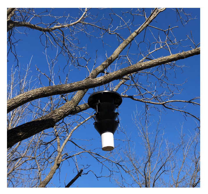
This trunk-mounted cone trap is used to monitor walnut curculio activity.

fungicides can be combined in the same sprayer to be applied during the critical spray window after pollination. Trunk-mounted cone traps should be used to monitor any additional curculio activity following the first insecticide application (see image below). A second insecticide treatment may be necessary if traps indicate significant curculio populations.