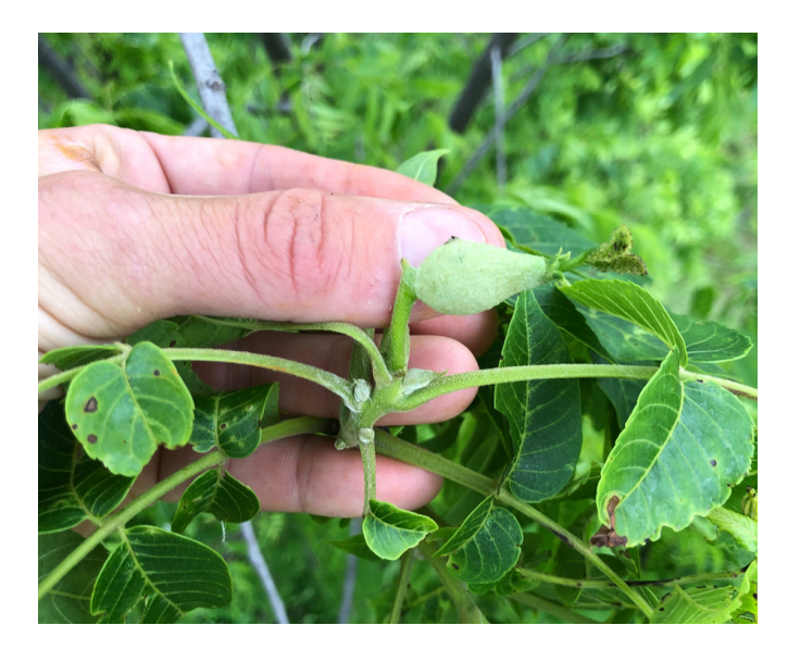
Pistillate flowers are pollinated when the ovule begins to swell, and the stigmas turn brown/black. Fungicides for season-long anthracnose control may be applied at this stage.