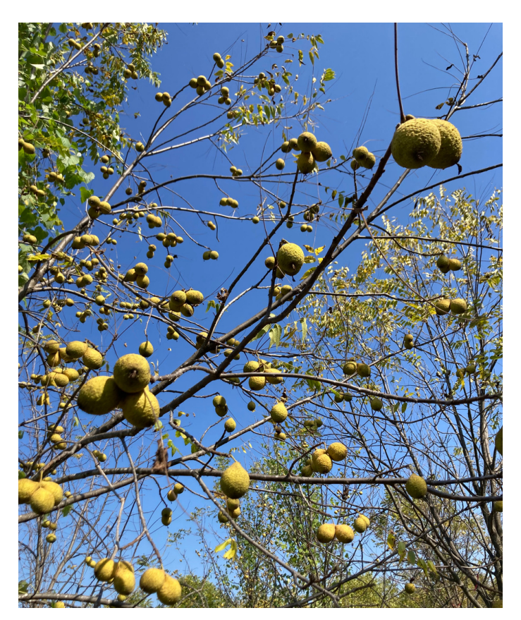
Nuts maturing on the limb of a black walnut tree