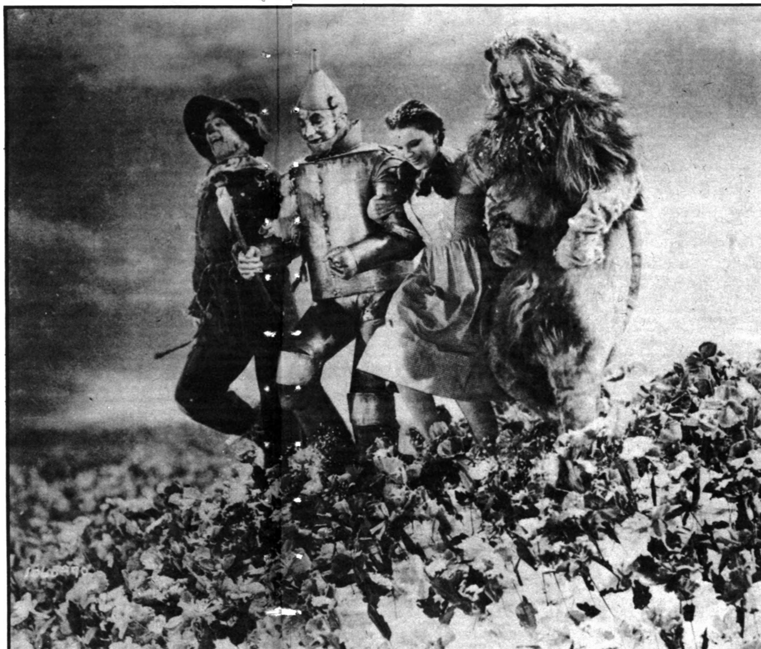
"The Wizard of Oz," starring Ray Bolger, Jack Haley, Judy Garland and Bert Lahr, comes to Memorial Union Aud. The 1939 musical-fantasy is one of the highlights of the MSA film schedule. See March 10 listing.

TEST: Mizzou's Counseling Services will offer Pharmacy College Admission Test (PCAT). Call 882-4801. WOMEN'S CENTER: "Where Do I Turn?" a discussion of the Columbia Human Rights Commission, will begin at noon in 1 Gentry Hall. Call 882-6621. UMC TRAINING AND DEVELOPMENT: A seminar on successful telephone techniques will be offered to office and support staff from 9 a.m.-noon in the training and development conference room in Lewis Hall. Call 882-4859 to enroll. STAFF COUNCIL: Group will meet at 1:15 p.m. in S204 Memorial Union.