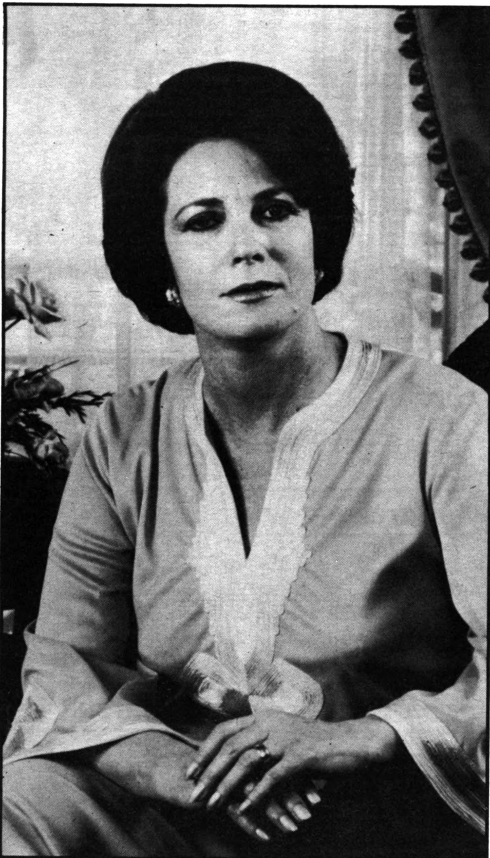
Jehan el-Sadat, renowned humanitarian and widow of Egyptian President Anwar Sadat, lectures at Jesse Aud. See Feb. 19 listing.

WOMEN'S CENTER: "Is There Life After Graduation?" a discussion of the challenges