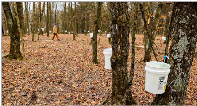
Figure 1. Survey respondents produced 480 gallons of syrup in 2022.

This guide aims to assist existing and new tree-sugaring enthusiasts with an interest in selling locally-made syrup by covering the basics of product marketing. The guide is structured around four marketing principles: product, pricing, place and promotion.