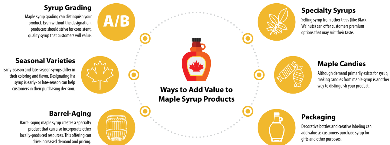
Figure 2. Examples of ways to add value to maple syrup products.