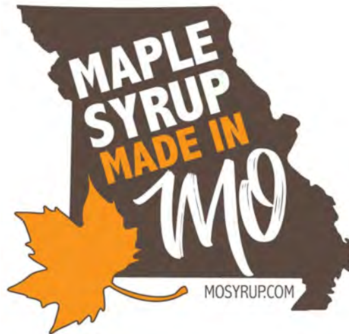
Figure 5. Example “Made in Missouri” maple syrup logo. Developed by the Missouri Maple Syrup Initiative.

Value-added agricultural producers who are interested in selling directly to consumers should consider the market for their product carefully. Four marketing principles: product, price, place and promotion are the fundamental components to building a marketing plan for a product. This guide is designed to aid maple and other tree syrup producers or entrepreneurs to improve or build their marketing efforts. Missouri’s tree syrup industry shows recent growth and strong prices within the state suggest the industry can continue to expand.