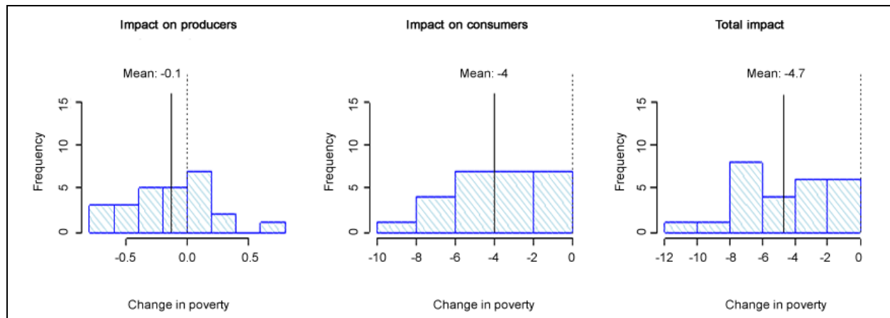
Figure 2. Distribution of changes in poverty rates due to higher agricultural productivity in developing countries (relative to baseline).

ing wages for hired labor (both of which lower their profits). While some producers, whose production is less factor-intensive, may see their revenues fall more than their costs, other producers benefit. On the other hand, consumers who face lower food prices and higher wages unambiguously benefit in this scenario (the second subfigure of Figure 1), with an average reduction in the poverty rate of 4.6 percentage points. A combination of these impacts, (shown in the third subfigure of Figure 1), show an average poverty rate reduction of 4.1 percentage points, and reductions in poverty in all but one country of the sample.