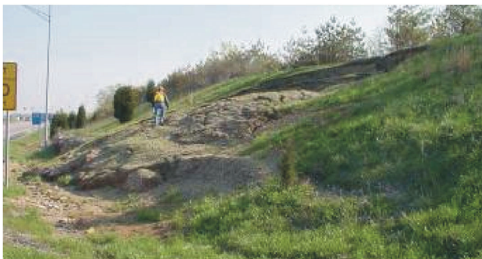
Figure 2 Slope Instability Observed During Survey

strength materials. Erosion issues observed included steep slopes, concentrated drainage or inappropriate materials being placed in areas of concentrated drainage (Figure 3). Pavement problems were extensive across the state, i.e., poor quality surface and failure of pavement